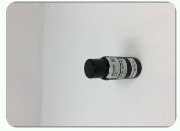
The photos on this report are of a sample collected by the lab and may vary from the final packaging.